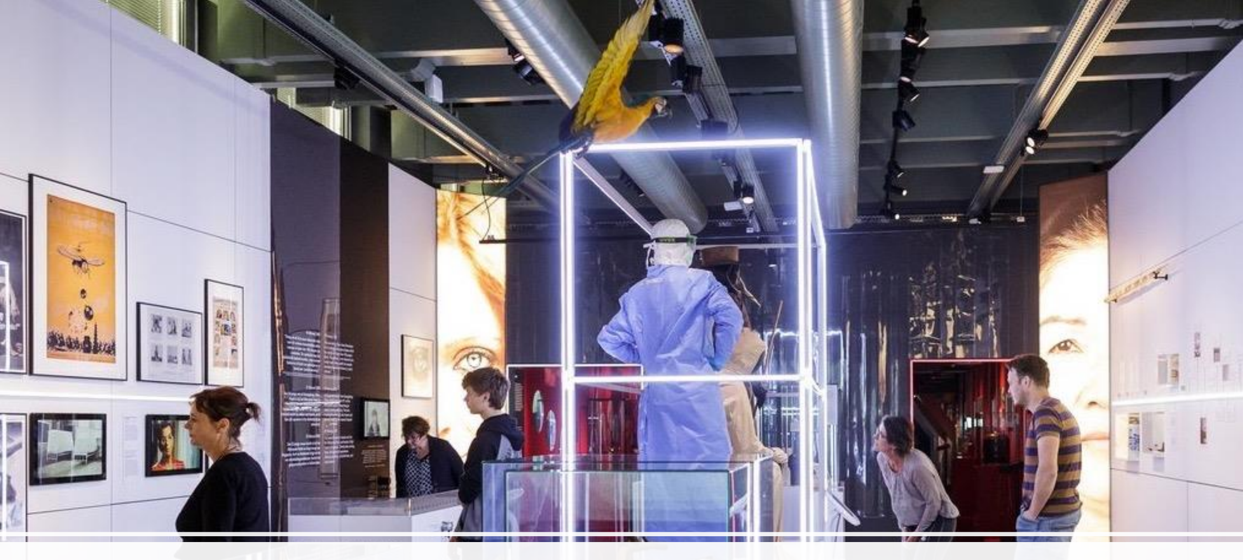
Besmet! Rijksmuseum Boerhaave, NL, 2020