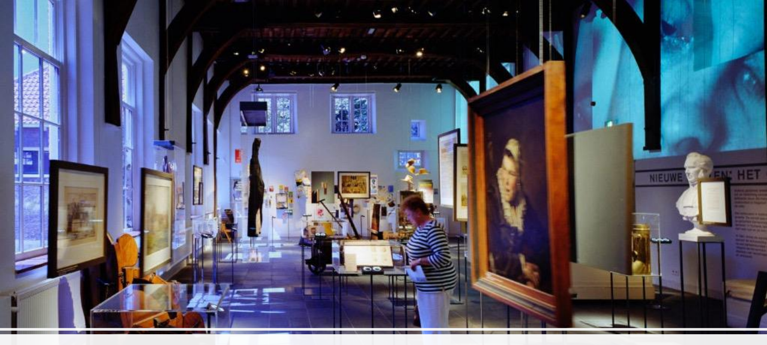
Het Dolhuys Museum of the Mind, Haarlem, 2015