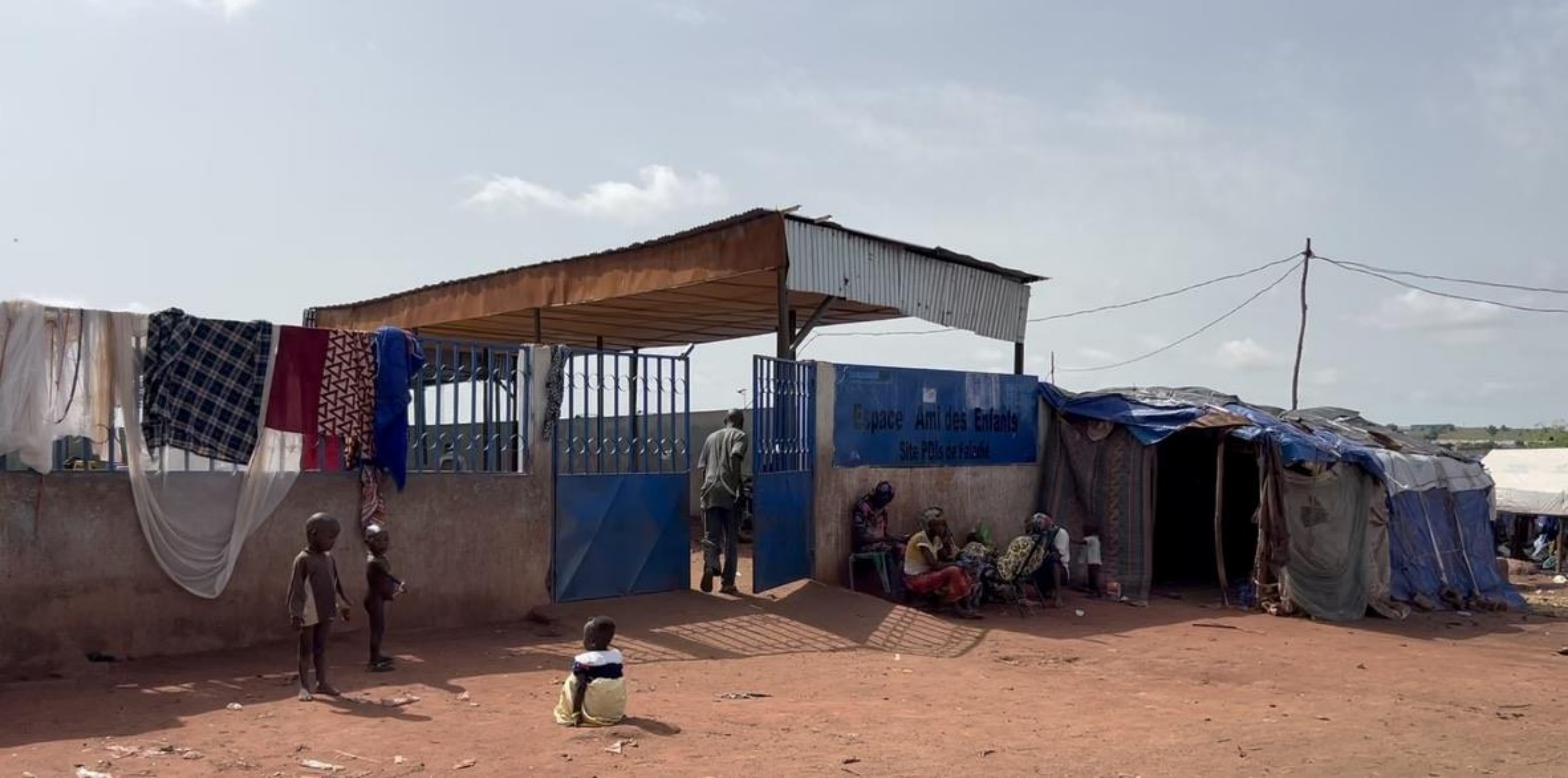
“The Centre des Amis, at the site of Faladie”